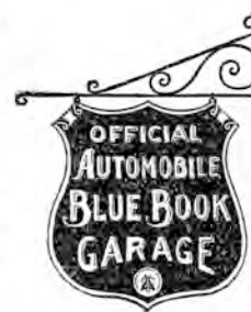
Figure 8. Signs advertising Official Automobile Blue Book hotels and garages from the 1914 Middle West volume.

Some of the Blue Book Garages display this sign. It marks the care the Publishers have used in accepting advertisers. In such Garages you can be sure of receiving the best of attention. The Blue Book in your car is a badge of distinction.