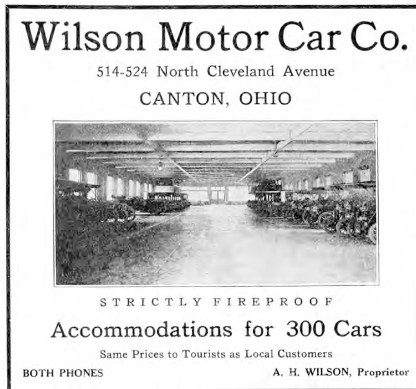
Figure 7. Hotel and garage advertisements from the 1914 Middle West volume.