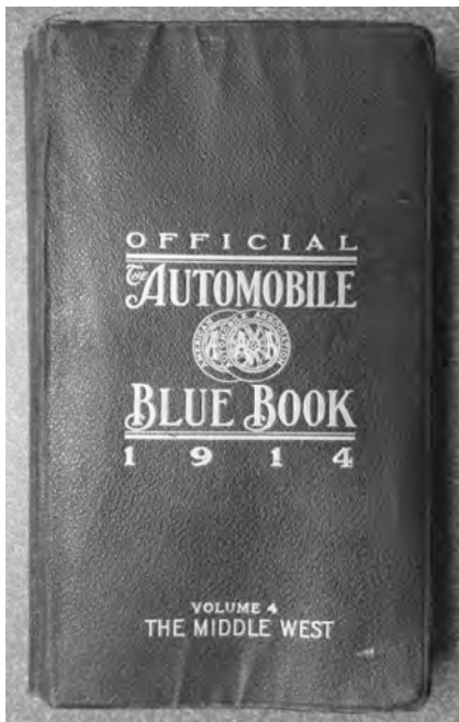
Figure 1. Cover of the 1914 Middle West volume of the Official Automobile Blue Book.

“Automobile Blue Book volumes were intended to be a single source of information for automobile tourists, an authoritative guide on which travelers could reliably depend throughout their entire journey.”