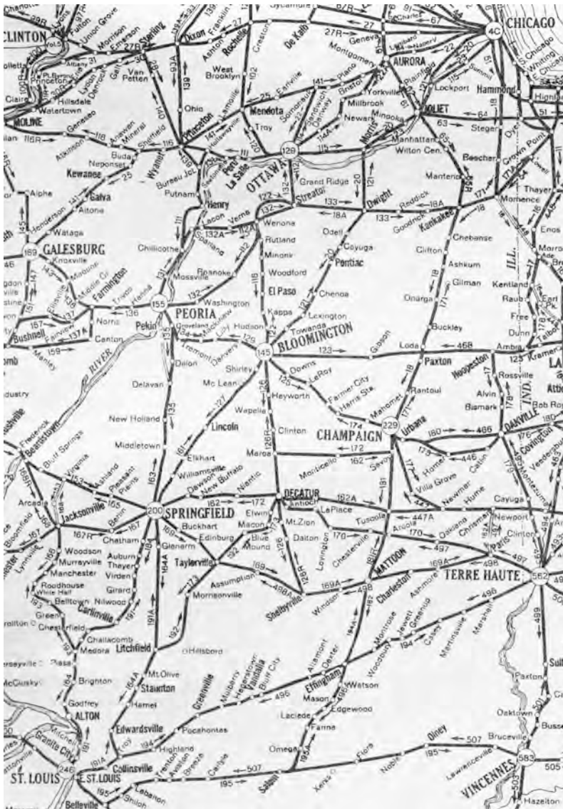
Figure 2. A portion of the skeleton index map for the 1914 Middle West volume.

Single volumes in the series often contained over five hundred routes, requiring eight hundred pages or more to describe. For example, the 1914 volume for the Middle West contains eight hundred routes spread across 932 pages. Because of the guide's format of textual turn-by-turn directions, though, each physical route had to be described twice, once in each direction, so the Middle West volume only contains four hundred origin and destination pairs. The forward and reverse versions of each route consisted of the same landmarks and turns; only the directions were reversed. This obligation increased the bulk of each volume and was cited by Ristow (1964) as a reason for their very thin pages. Reverse routes were indicated on the skeleton index maps (Figure 2) and in the route text.