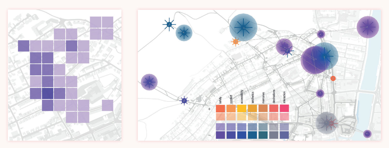
Figure 3. Overviews of selected data aggregated across all participants. Left: Grid-based aggregation of negative valence in the category "comfort" from expressions of all participants. Right: Topical associations with a negative valence, across all participants. Note: the place of origin of the association may be perceived positively.

Figure 4 shows a visualization of sense of place valence in combination with attributes of the locale. The background shows the valence of all participants' expressions that fell into the "aesthetics" sense of place category, aggregated using a grid. The grid size can be varied, but should allow