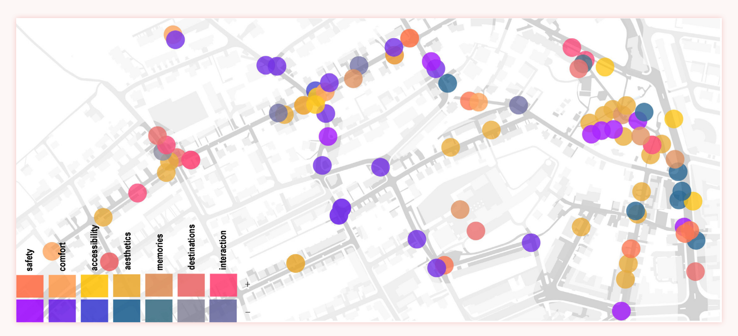
Figure 1. An extract of an overview visualization showing all localized data chunks, their categorization, and valence. The background map is subtly emphasized within a buffer of 20 meters around the routes, to show the area covered by the walking interviews. Clicking the points allows the user to view the original data chunks.

Figure 1 shows a part of an overview visualization in which all expressions are symbolized by sense of place category and valence, according to the principles detailed in section 4.4 and Table 1. Additionally, the background map is emphasized within a buffer of 20 meters around the different routes the participants walked (darker grey background map elements within the buffer area), to show the areas covered or not covered during the walking interviews. The visualization allows a first assessment of the spatial distribution and clustering of different categories, as well as positive and negative expressions. The social