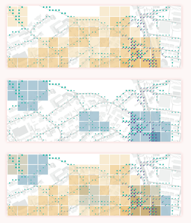
Figure 4. Gridded density overviews of the category "aesthetics," overlaid with bivariate squares symbolizing the green space index (green) and bench index (purple), calculated for short road segments (Bleisch and Hollenstein 2017). The background features expressions with a positive valence (top), negative valence (middle), or both valences (bottom).

for some aggregation of the data. The top, middle, and bottom of the figure show, in the background, aggregations of positive, negative, or both valences, respectively. While the bottom one mixes colors, this could be