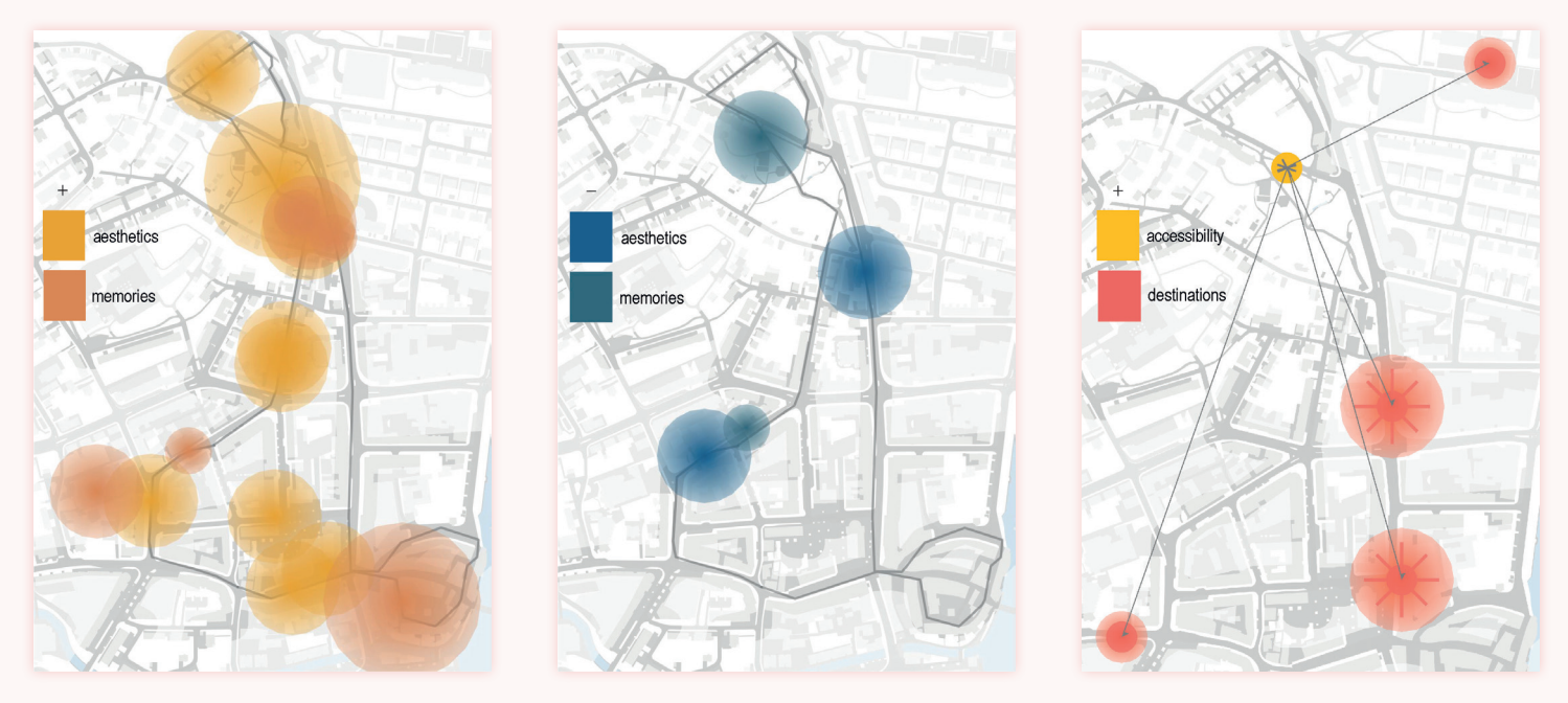
Figure 2. Filtered views of selected sense of place data. Left: Route of a single participant and their expressions of positive valence in the categories of memories and aesthetics. Circle size approximates place extent. Center: The same participant and categories as on the left, now showing negative valences. Right: Accessible destinations (red circles) referred to by a participant while standing at the location marked with a yellow circle (topical associations). The circles are used to approximate the place's location, while the overlaid opaque large dot and the rays indicate an uncertain extent associated with the location.

scientists pointed out that in QDA that does not use spatial displays, they more often think about the data semantically than spatially. The original text of the qualitative data chunks can be accessed through the point symbols to reconsider the sense of place categorization or the valence judgment, as well as to get a more detailed impression of the spatial distribution and of distance between specific statements and associations.