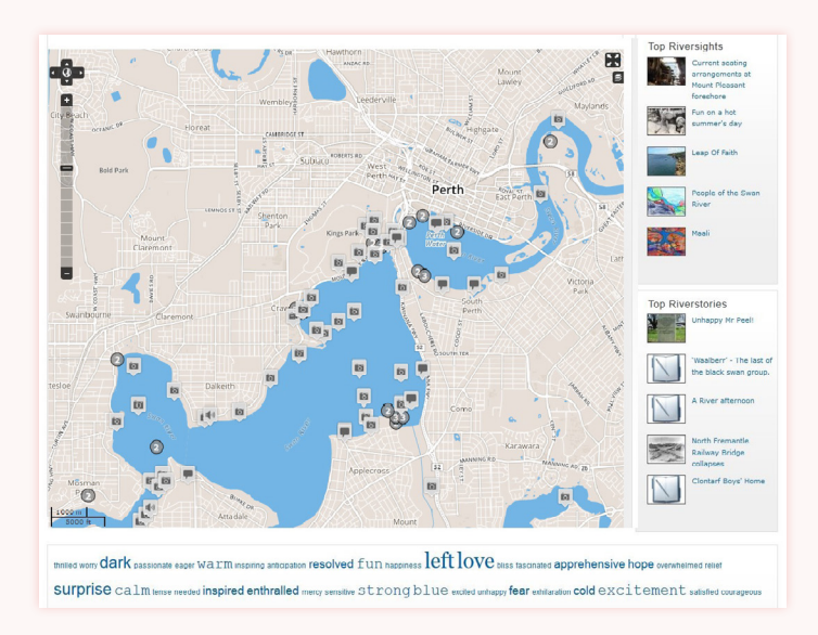
Figure 2. The online web interface was available at riversofemotion.org.au. It can now be accessed through the Wayback Machine at: web.archive.org/web/*/riversofemotion. org.au.

People viewing the website could then click into individual accounts associated with points on the map, or find records through a keyword search function. Each entry had an information page displaying the details provided by the contributor. There are two key ways in which these records were sorted or given associations within the database. Primarily, they appeared in the web interface under four categories depending on the format of the contribution: