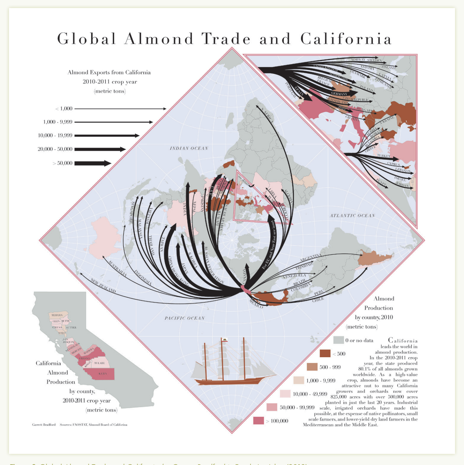
Figure 3. Global Almond Trade and California by Garrett Bradford in Food: An Atlas (2013).