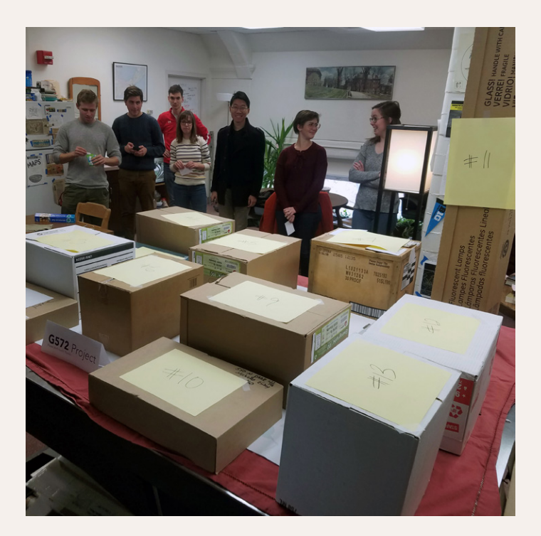
Figure 3. The tile and materials selection process.

Before starting on their tile, students first evaluated their materials according to the forms, colors, types, and textures they afforded. To facilitate this deconstruction process, and to help students consider how best to apply these stylistic dimensions to the OSM linework and any other prominent features they wished to depict, we provided the worksheet seen in Figure 4. We assigned this worksheet as the first deliverable for the Mapbox Studio