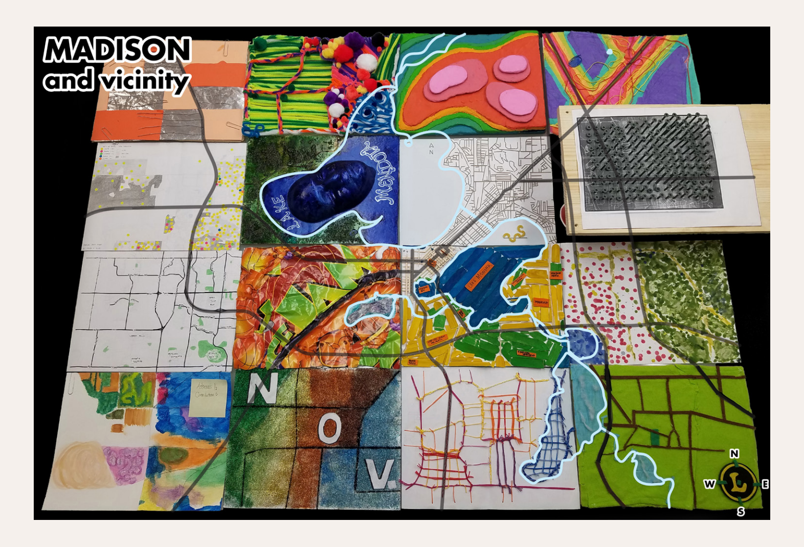
Figure 1. Madison and Vicinity, a tangible map quilt created collectively by an advanced cartography class at the University of Wisconsin–Madison. Shot at an angle of approximately 60° to capture the verticality of the design, with some roads and water features superimposed for context. Data source: OpenStreetMap; Photo: Robert Roth.

The sketch mapping activities culminated in a tangible map quilt assignment (Figure 1) that took inspiration from two fantastic NACIS collaborative design projects: the 2015 Tangible Map Exhibit (Dooley, Coolidge, and Rose 2016) and the annual NACIS Map Quilt. With a focus on design diversity across the quilt patchwork, this final "sketch" mapping activity used a range of tangible but un familiar materials. As Dooley, Coolidge, and Rose write, "By making in a new, unfamiliar medium, we can create judgment-free spaces that allow for experimentation, risk-taking, and the unexpected" (2016, 25). The tangible map quilt activity aligned with several