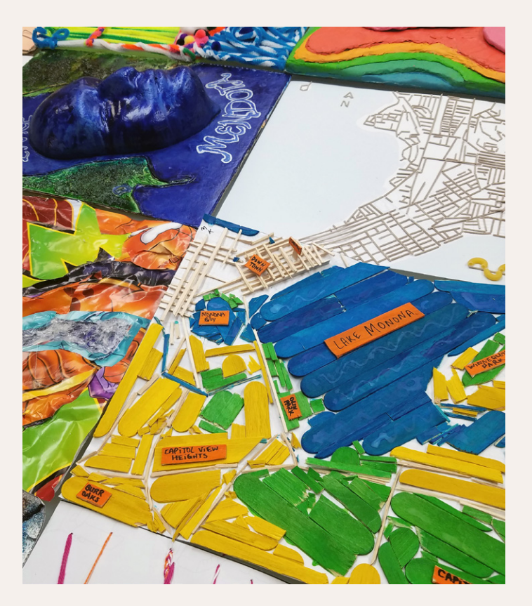
Figure 8. Detail images of Madison and Vicinity.

process before jumping to digital technology led to less frustration and more experimentation in the subsequent Mapbox Studio lab assignment. Overall, students were more willing to lean into the styling constraints of OSM data and ultimately produced extremely creative designs. We also believe that the tangible map quilt activity led to better comprehension of lecture discussion regarding aesthetics and style on the final exam (a hint to future students finding this article: the final exam now includes an