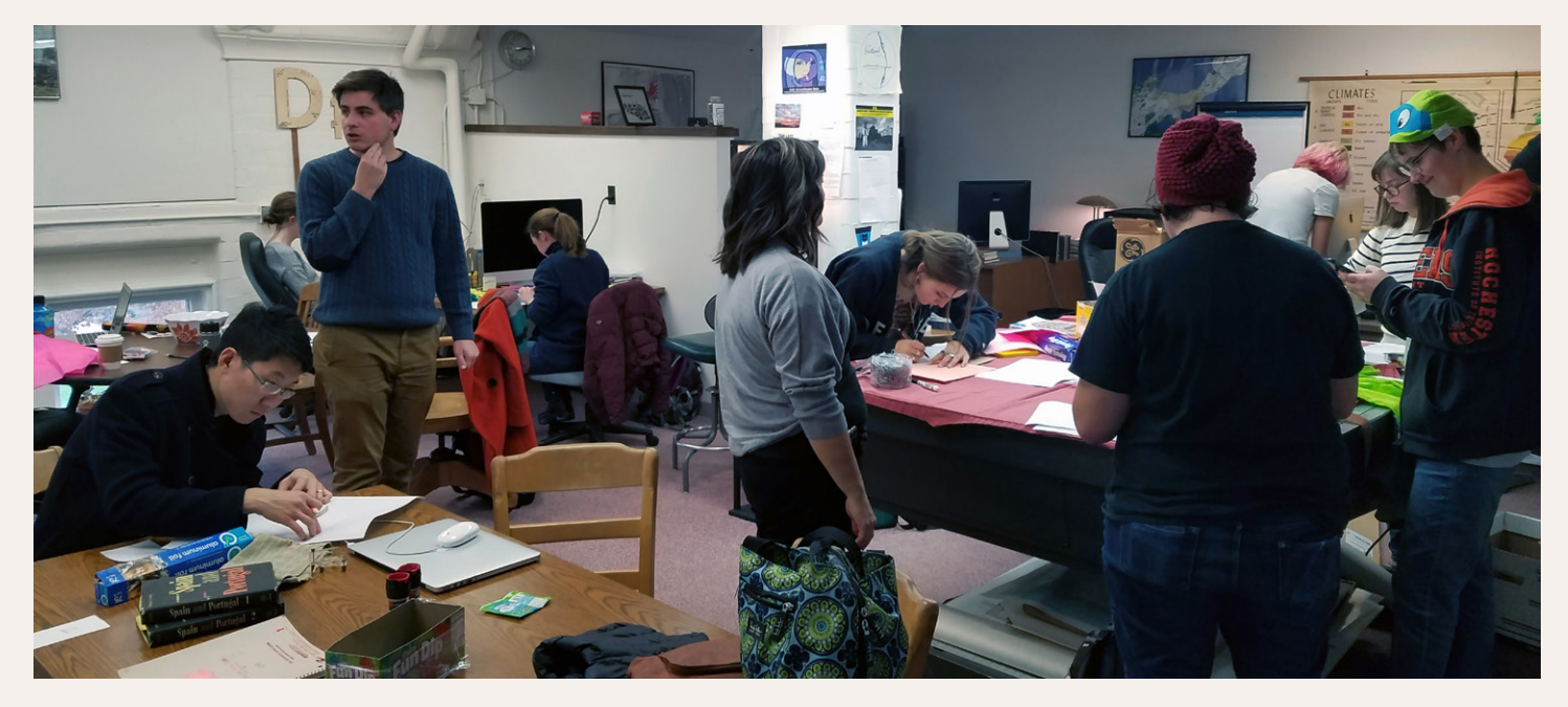
Figure 5. Tangible map quilting in the UW Cart Lab.