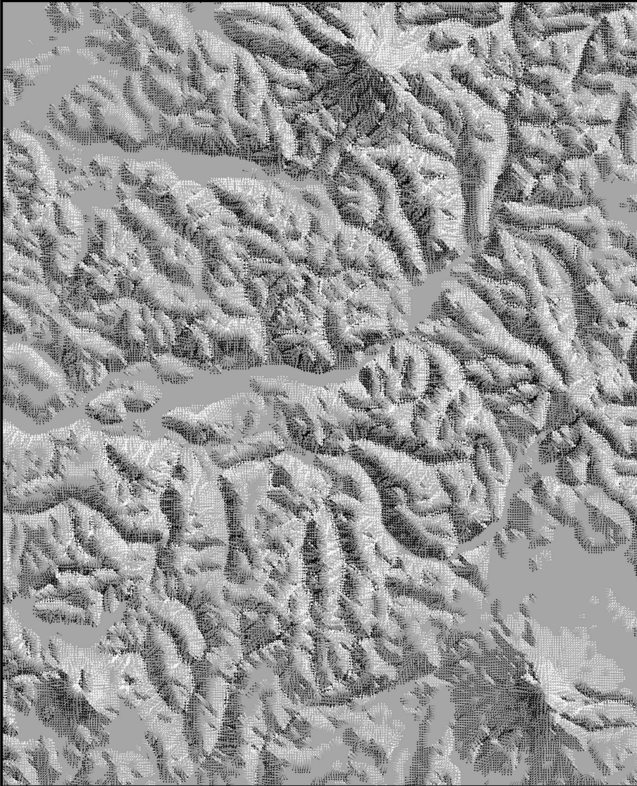
Figure 2. A small-scale hachure map of the Cascade Mountains of Washington state with illumination from the northeast. The scale is 1:450,000 and north is to the top of the page. Mt. Rainier is near the north edge and central. Mt. Adams is in the southeast corner and Mt. St. Helens is in the southwest corner. The Cowlitz River valley cuts through the central portion of the map.

We joined the slope and aspect themes in ArcView based on location. To perform a spatial join, the