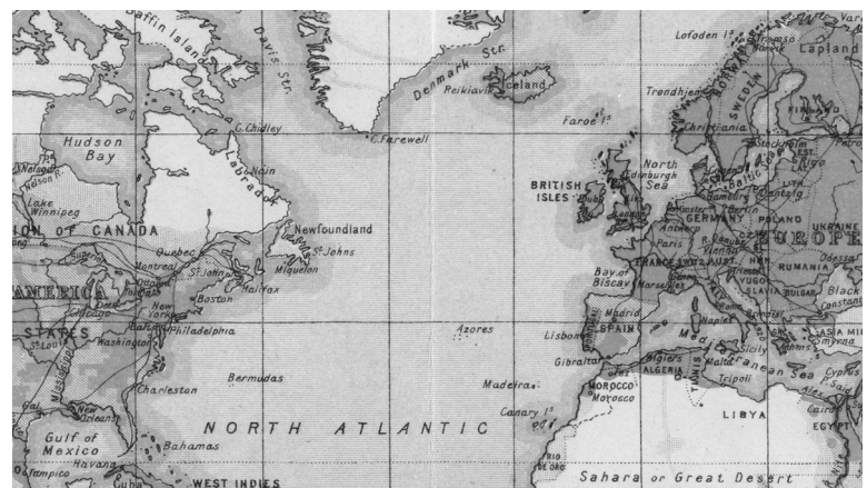
Figure 2: Detail of “Cartography of the World 1921,” showing the area bounding the North Atlantic. With the obvious exception of Labrador, much of eastern North America and most of Europe appear in red or shades of red, thus proclaiming the accuracy of maps available for those areas. Great Village, home of Bishop’s maternal grandparents, is located fifty miles north of Halifax (Nova Scotia) at the eastern end of the deeply indented bay.

“How appropriate if Bishop’s inspiration turns out to be a map about maps.”