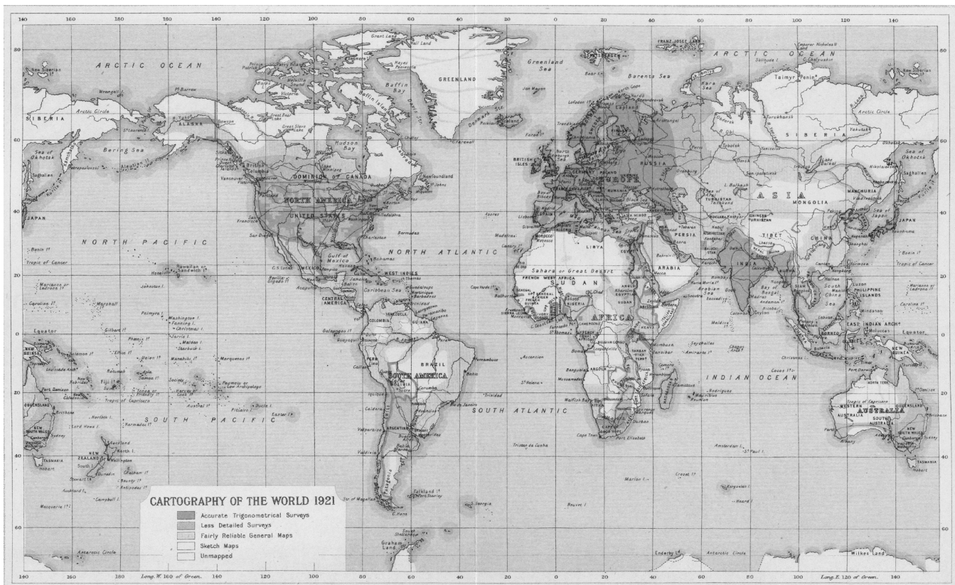
Figure 1: “Cartography of the World 1921.” Detail of Plate 1, “Mapping of the World,” in The Times Survey Atlas of the World , London: The Times , 1922. This central map, measuring approximately 6 3/4” x 11 1/4”, was prepared at the Edinburgh Geographical Institute under the direction of John George Bartholomew. The Times Survey Atlas of the World was a landmark atlas with a general index of over 200,000 names and one hundred maps reflecting national surveys, explorers’ reports, and the territorial redistributions obtained by the 1919 Peace Conference in Paris. (This digital file image was supplied by David Rumsey of the David Rumsey Collections, http://www.davidrumsey.com . His stunning online collection of privately owned maps utilizes cutting-edge software and features thousands of maps scanned at very high resolution.)

“The Map” had to do with a red map. There was nothing particularly noteworthy about it, but I was attracted by the way the names were running out from the land into the sea.