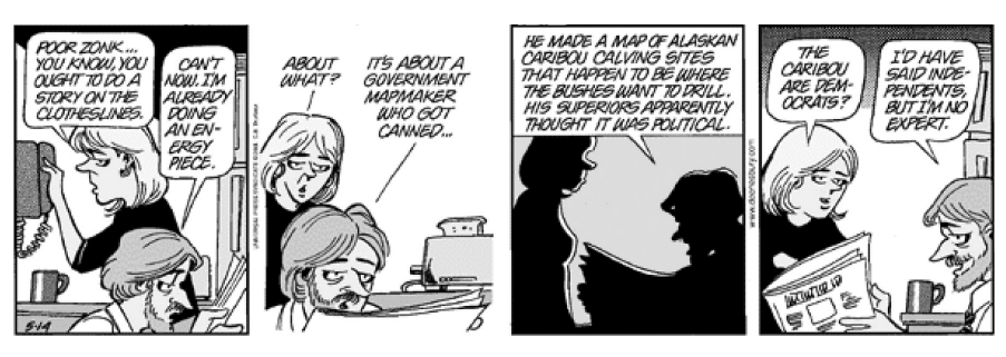
Figure 1. In this Doonesbury cartoon, the joke is dependent on a distinction between the content of the map being political (caribou—as—Democrats) and the position of the map within a political situation and how it helps constitute that political situation. (Used with permission of Universal Press Syndicate.)

It is precisely not a question therefore of examining "the" political in mapping, which is how the question has been framed until now. It is not a question of "looking for" the political in maps, for this would be to assume an a priori realm of the political which is sometimes injected into maps and which makes their content political. On this view we are mislead into uncovering this political content, which is the project I argue Harley pursued. On the view I am discussing here, the project is rather to