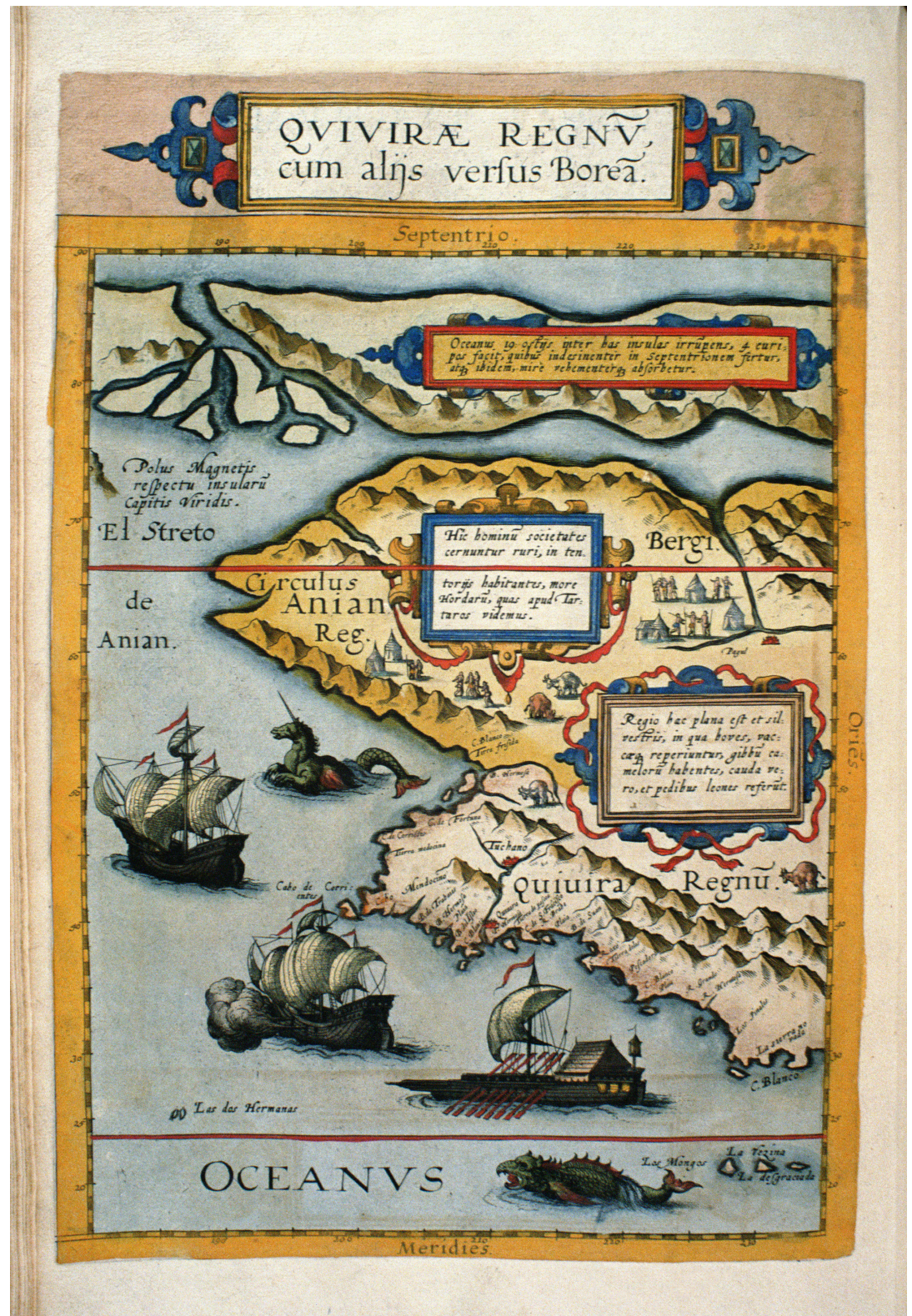
Earle Birney's "Mappemounde" Figure 9

Cornelis de Jode, Quivirae Regnum cum aliis versus Boream ("Realm of Quivira and Other Northern Territories"), the western extension of his America Pars Borealis... ("Map of North America"), Antwerp, 1593. Hand-colored copperplate engraving (Ayer *135 J9 1953, Part 1, folio XII). Size of the original: 34.5 x 23 cm (13 1/2" x 9").