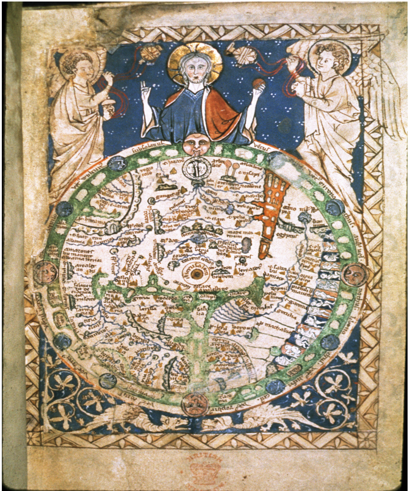
Earle Birney's "Mappemounde" Figure 1

Psalter Map, circa 1300 (BL Add.28681 f 9). Size of the original: rectangular frame, 14.5 x 10 cm (5 3/4" x 4"); diameter of circular world, 9.5 cm (3 3/4"). By permission of The British Library.