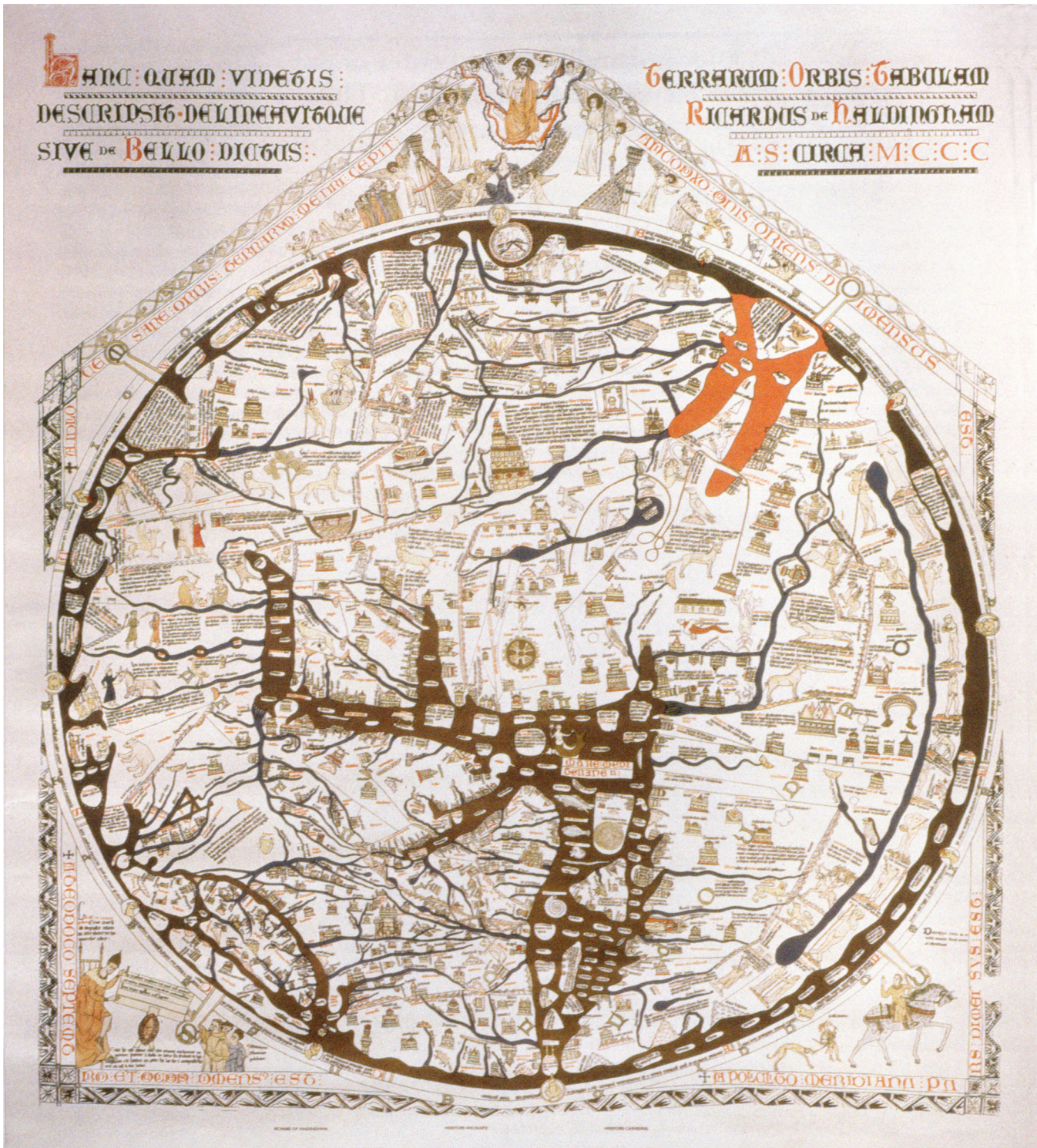
Earle Birney's "Mappemounde" Figure 6

The Hereford Map, circa 1300, in a nineteenth-century facsimile. Size of the original map: approximately 1.59 x 1.29-1.34 m (5'2" x 4'4"). ©Peter Whitfield. By permission of Peter Whitfield.