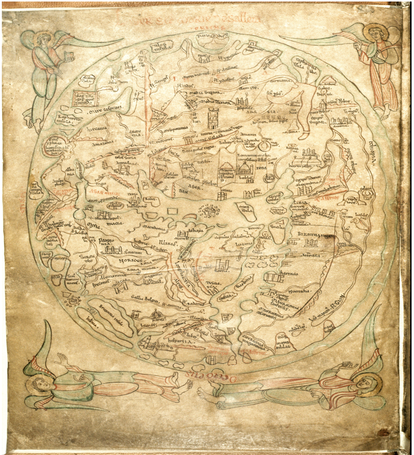
Earle Birney's "Mappemounde" Figure 5

The Sawley Map, twelfth century (CCC MS 66, p.2). Size of the original: 29.5 x 20.5 cm (11 1/2" x 8 1/2"), with the modern binding 31.5 x 2.2 (12 3/4" x 7/8"). By permission of the Master and Fellows of Corpus Christi College Cambridge.