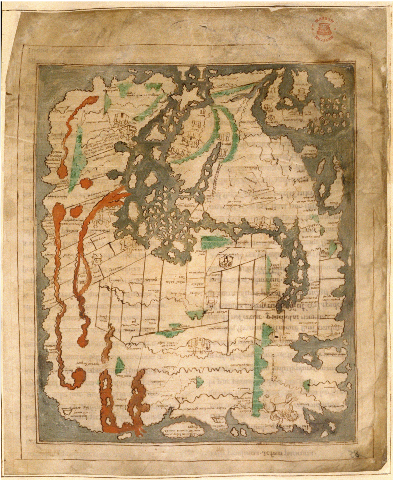
Earle Birney's "Mappemounde" Figure 4

The Anglo-Saxon, or Cotton [Tiberius] Map, tenth or eleventh century (BL Cott.Tib.B.V f 56v). Size of the original: 21 x 17 cm (8 1/2" x 7").