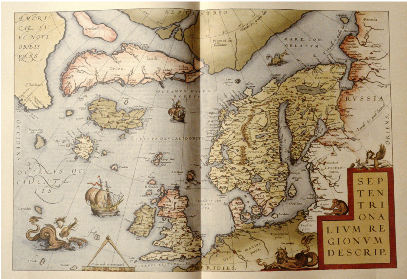
Earle Birney's "Mappemounde" Figure 8

Abraham Ortelius' Septentrionalium Regionum Descriptum ("Map of the Northern Regions"), from his Theatrum Orbis Terrarum , 1570, plate 45 (Antwerp: Aegid. Coppenium Diesth.; reprinted, New York: American Elsevier, 1964).