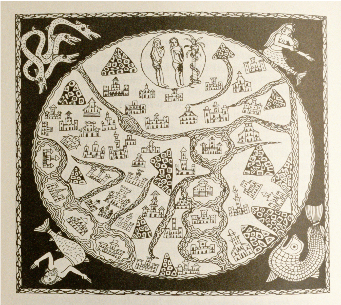
Earle Birney's "Mappemounde" Figure 2

Sketch of a generic medieval world map or mappamundi. Size of the original: diameter of circular world, 10 cm (4"). Untitled and uncredited in Earle Birney's The Cow Jumped Over the Moon: the writing and reading of poetry , Toronto: Holt, Rinehart and Winston of Canada, 1972, 84. By permission of Harcourt Canada.