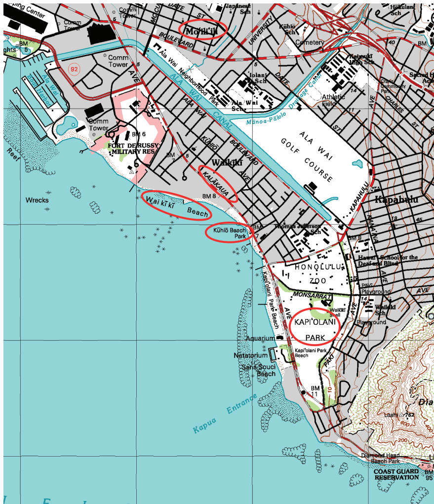
Figure 3. Section of the Honolulu 1980 Series U.S.G.S. 7.5-minute Topographic Quadrangle of Waikiki.