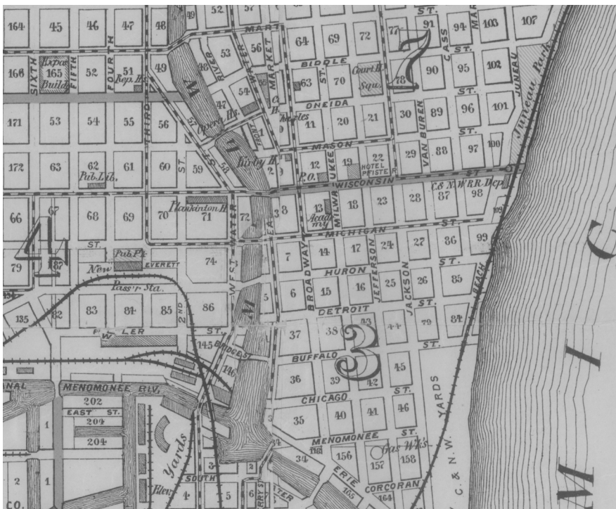
Figure 3. Milwaukee River, Downtown, 1898. Fragment of Wright's Map of Milwaukee, published by A.G. Wright, Milwaukee, 1898.

request of local businesses, real estate, and insurance companies, and include images of store grand openings, parades, churches, movie theaters, new housing, car accidents, and floods. They vividly document the life of the primarily Polish-American com-