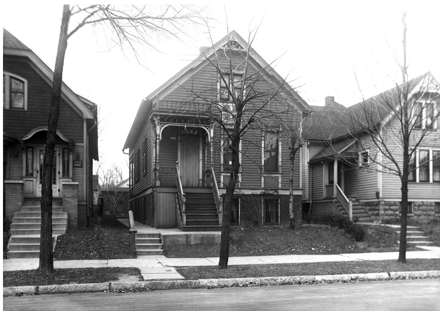
Figure 4. Polish flat on Milwaukee's South Side, 1933.

Since the project utilizes source materials in a variety of formats, including photographic prints, slides, glass plate negatives, and maps, the conversion process from analog format to digital required versatile scanning equipment. A film scanner Nikon 4000 ED, a large format scanner Colortrac 4280, and two flatbed scanners Microtek ScanMaker E6 and