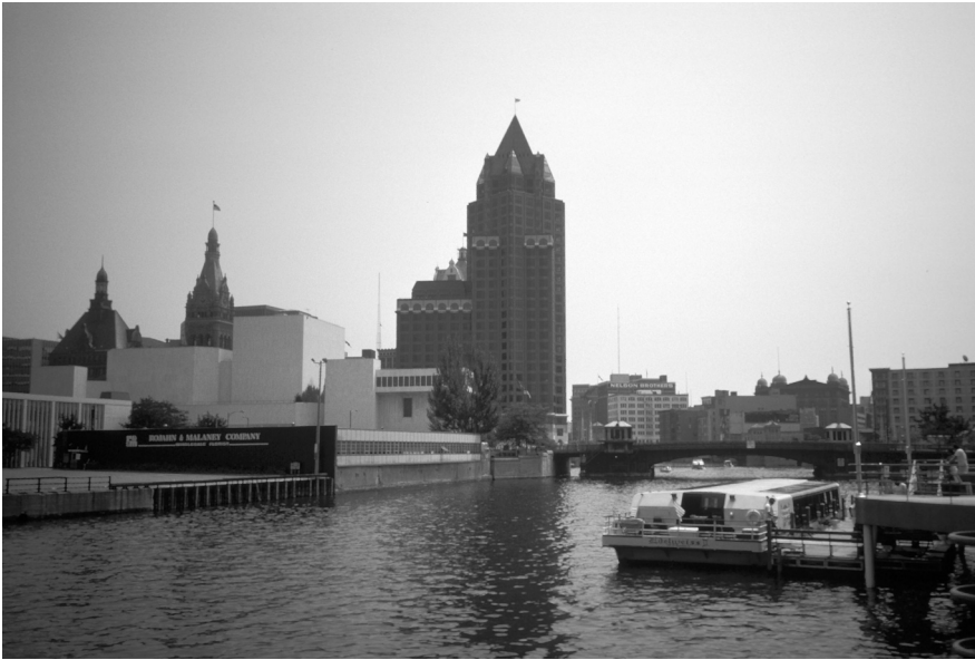
Figure 2. Milwaukee River, Downtown, 1989.