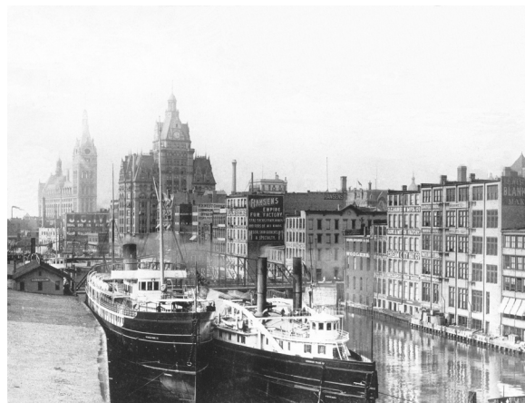
Figure 1. Milwaukee River, Downtown, 1895.