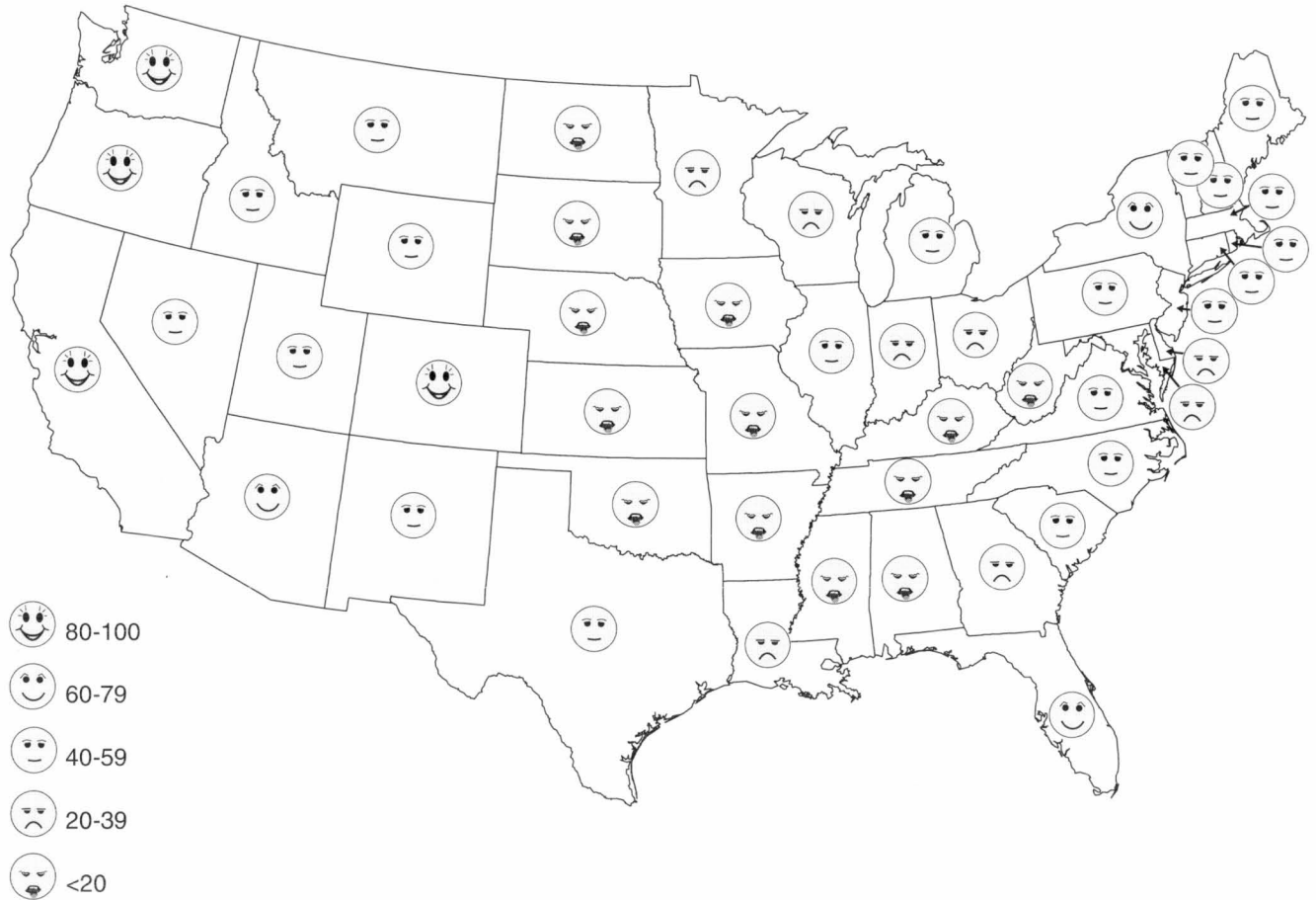
Figure 3. Pseudo-Chernoff face preference map of PCA scores from state rankings, based on five equal-interval classes.