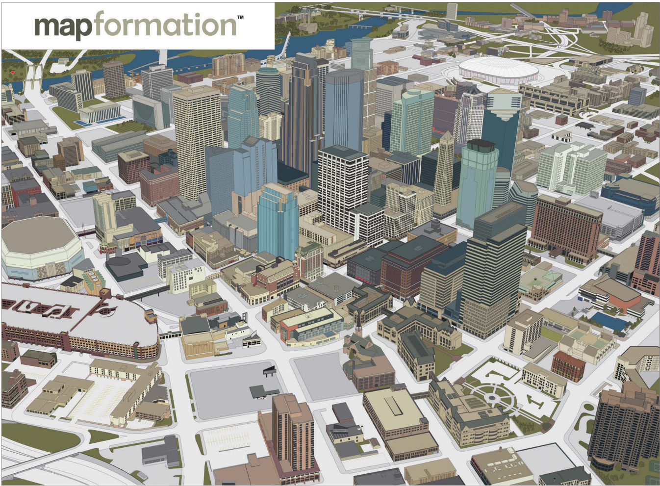
Downtown Minneapolis, Minnesota