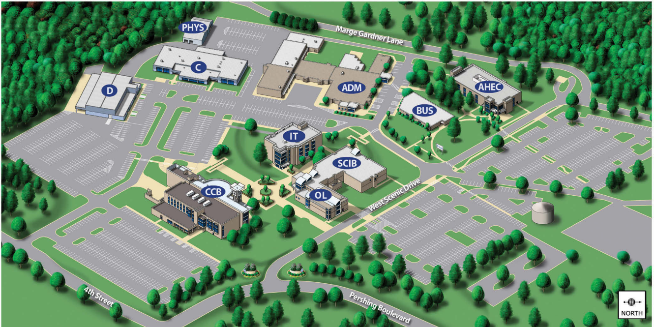
Produced and last updated for Pulaski Technical College in May 2006 by mapformation