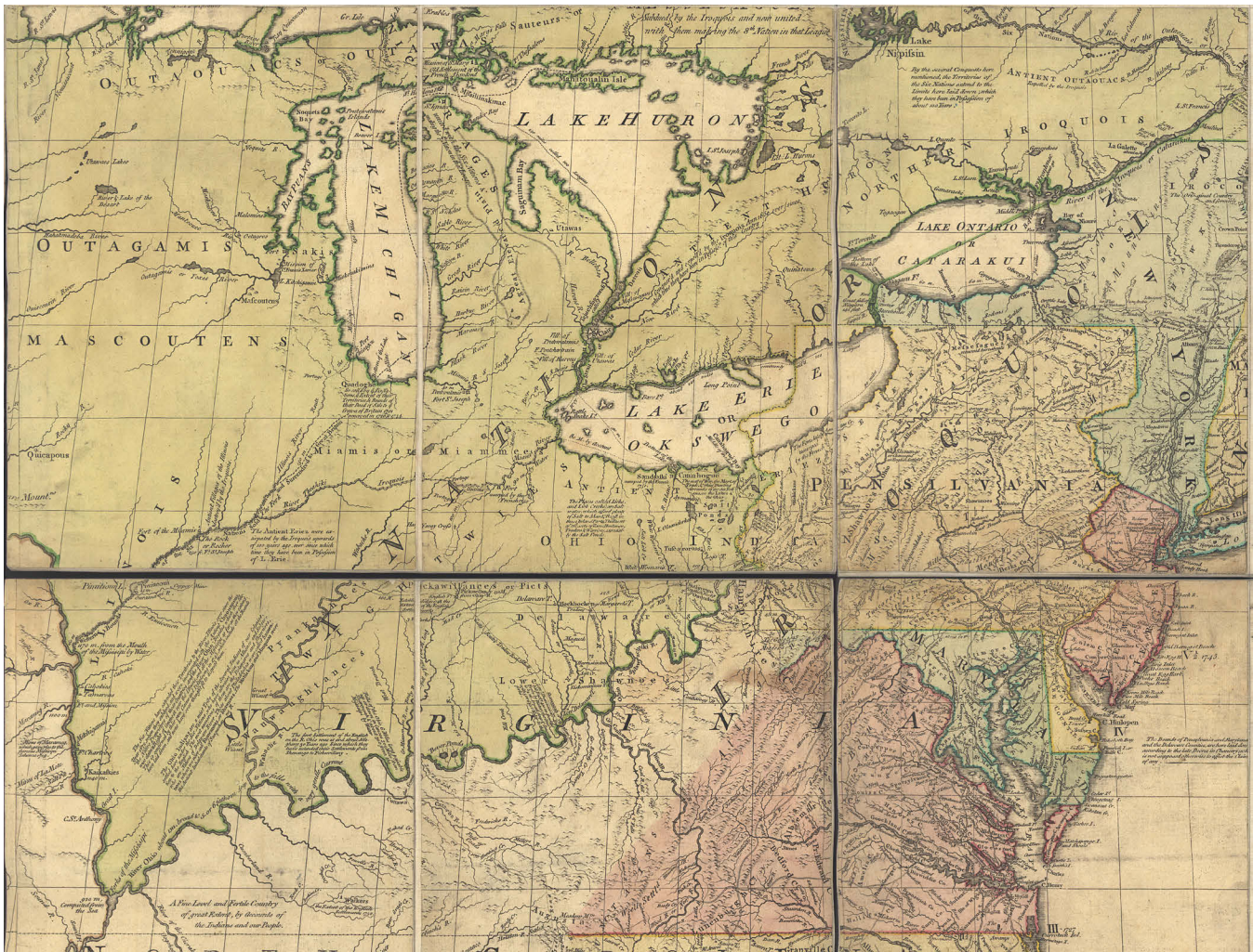
Figure 4b. Detail of the area of Lake Ontario and of political boundaries from sixth variant.