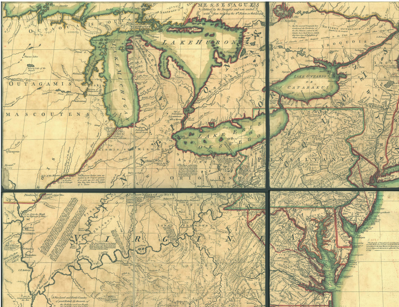
Figure 4a. Detail of the area of Lake Ontario and of political boundaries from first variant.