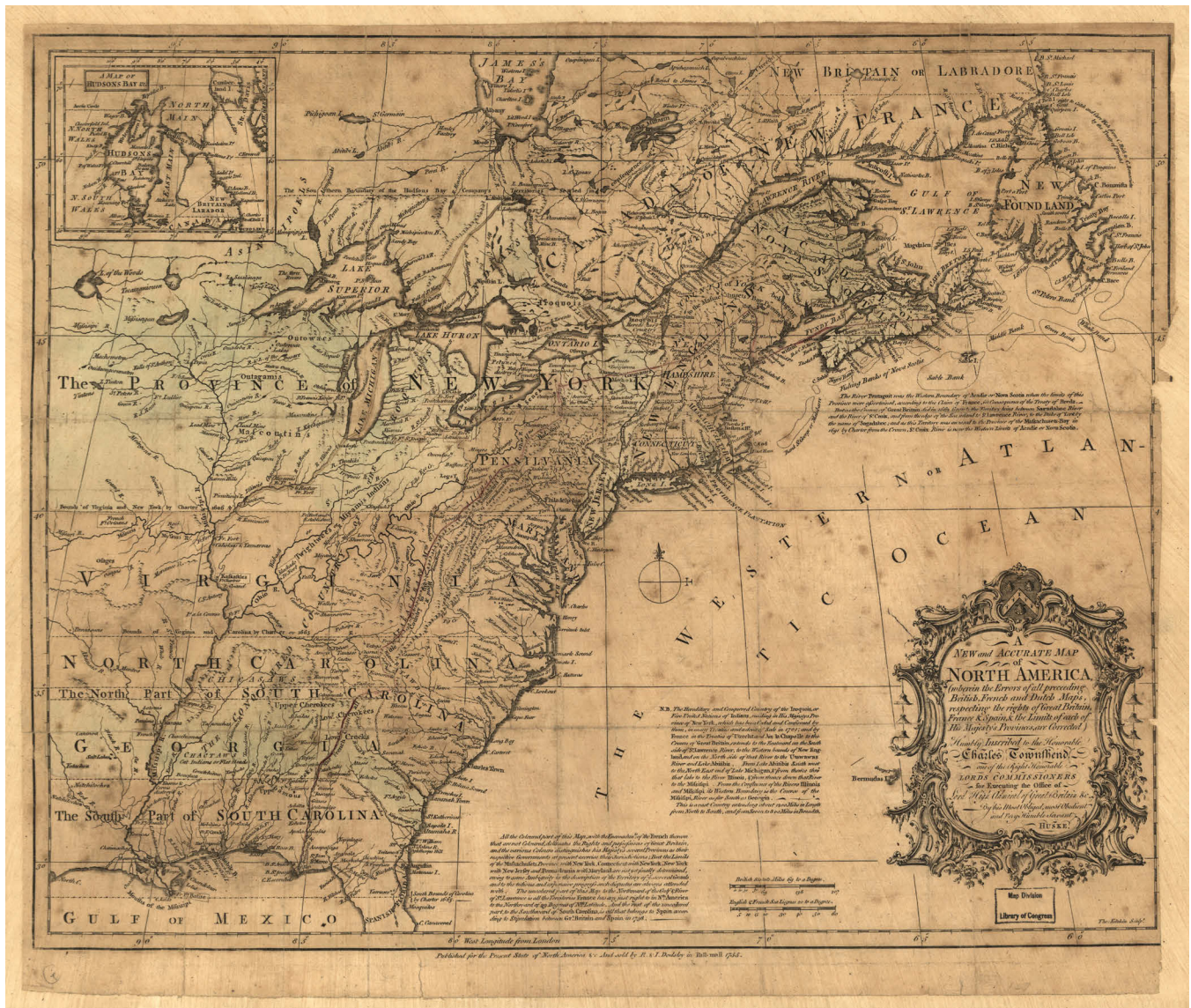
Figure 3. A New and Accurate Map of North America.. Humbly Inscribed to the Honorable Charles Townshend one of the Right Honorable Lords Commissioners for Executing the Office of Lord High Admiral of Great Britain &c By his Most Obedient and Very Humble Servant Huske, engraved by Thomas Kitchin, in John Huske, Present State of North America (London: R. & I. Dodsley, 1755). 39cm x 49cm.