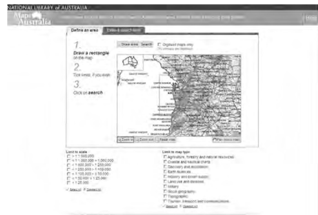
Figure 5. National Library "Maps of Australia" prototype search. (see page 90 for color version)

The design so far is based primarily on decisions made within the Library to allow rapid development of the prototype. Feedback, ideas for improvement,