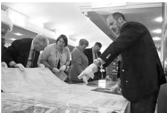
Figure 2. Hands on maps Maps, “White Gloves” event, 12 March 2008.

The role of the Curator of Maps also includes a number of ex-officio and supplemental roles that accrue ongoing status and networking benefits to the Library. External stakeholder representational work may range from engaging with cartographic societies and support networks to more practical national coordination of data and standards, while each contributes to the profile of Maps in areas of antiquarian, historical, and geospatial research.