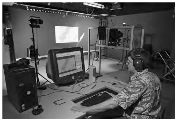
Figure 4. Maps digitisation studio and vacuum board, October 2007.

The first project determined that direct scanning of originals with a digital (scanback) camera, rather than scanning of surrogates (such as photographic transparencies previously taken for conservation purposes) provided higher quality images. The second project established the technical requirements of such scanning. In 2001 the National Library embarked on a major expansion of its digitization program. The aim is to provide Library users with increased access to the special collections material through digital delivery. Each type of collection material has different requirements for digitization, as well as the management, storage, and delivery, and the Library developed a