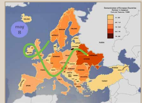
2010 winner for best Narrative map