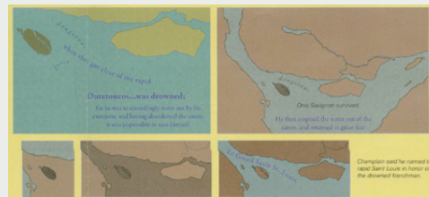
Figure 3. Drowning insets.

In the inset map sequences we find specific episodes from Champlain's travels. As the authors move through each small map in the series, they carefully shift location, scale, and color palette to influence the reader's understanding of the story being told. The darkness of death, the red of blood, the loneliness of a small island amidst the water—all of these play quietly upon our feelings, reinforcing the tone of Champlain's words. The map engages us at an emotional level; something critical for effective storytelling (Figure 3).