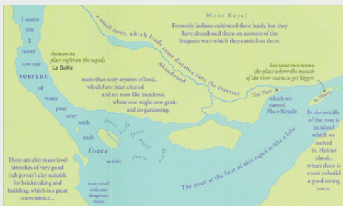
Figure 2. Torrents inset.

Within that simple framework the authors have created a work that is as deep and engaging as it is unassuming in appearance. This is not merely a catalogue of the path of Champlain's travels overlaid onto some local hydrography and annotated with a few quotations from his writings. Here, Champlain's words are the star. The text is supported and enhanced by the spatial representation, not the other way around. In reading They Would Not Take Me There , we are reading Champlain's journals, arranged not linearly, but instead embedded in their spatial context. When Champlain says that he "never saw any torrent of water pour over with such force as this", we see his words define the location of the very