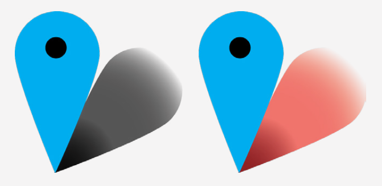
Figure 2: The first image is an example of a shadow that would represent the existence of EXIF data for location. The second image, using a red shadow, represents missing data.

Bailey, Jonathan. 2010. "Flickr and Facebook STILL Strip EXIF Data." Plagarism Today. Accessed April 14, 2013. http://www.plagiarismtoday.com/2010/04/22/ flickr-and-facebook-still-strip-exif-data/.