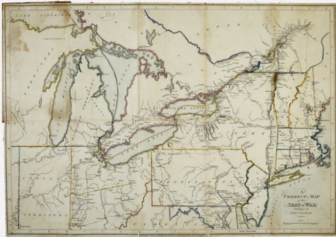
Figure 7: A Correct Map of the Seat of War, drawn by Samuel Lewis, 1812.

inset, “Sketch of the engagement on the 24th of August 1814 between the British and American forces,” the Battle of Bladensburg, Maryland, also known as the Bladensburg Races. The American militia fled through the streets of Washington before the British entered the city unopposed