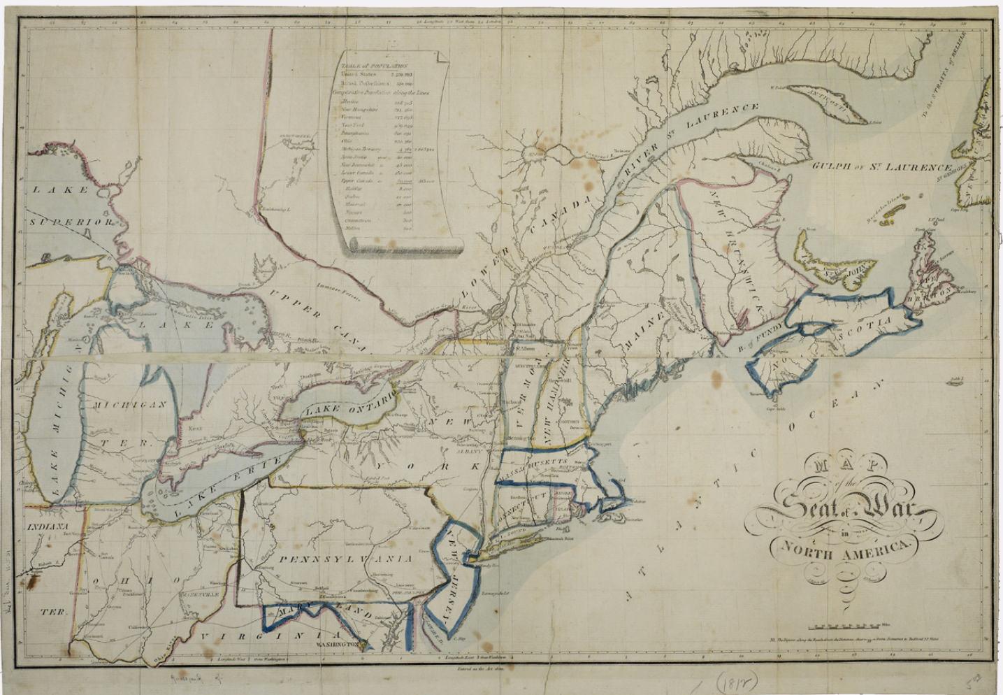
Figure 4: Tanner's The Map of the Seat of War in North America, 1813.

That same year, Melish published several new maps which showed other areas that would likely be affected by the spread of war. The Military and Topographical Atlas of the United States , released in late 1813, consisted of eight such