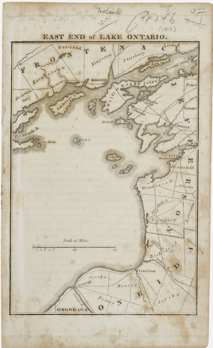
Figure 5: Melish's East End of Lake Ontario, 1813.

maps engraved by Tanner. It included innovative smaller maps which offered a more detailed view of areas which had already seen extensive fighting, including the East End of Lake Ontario (Ristow 1985, 181) (Figure 5).