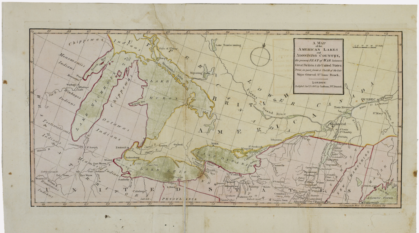
Figure 8: Luffman’s A Map of the American Lakes and Adjoining Country, 1813.