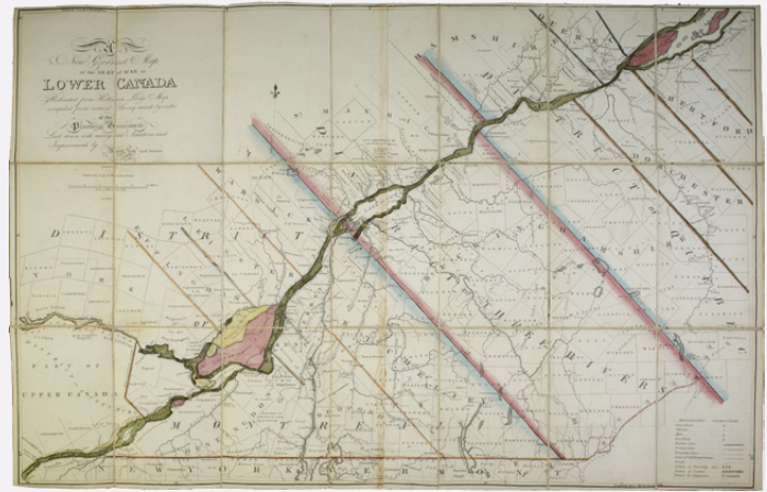
Figure 6: Amos Lay, A New Correct Map of the Seat of War in Lower Canada, 1813.

An expanded edition of The Military and Topographical Atlas of the United States , published after the Peace of Ghent in 1815, featured twelve maps, including a map of the New Orleans area. Specifically associated with the War of 1812, these publishing projects distinguished Melish as one of Philadelphia's premier cartographic publishers. Seeing the profit to be made, other commercial publishers also entered the fray. Some of these Philadelphia competitors were at the same time collaborating with Melish on other publishing projects.