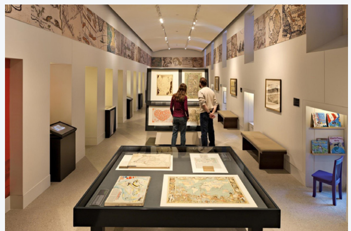
Figure 1. Visitors enjoy the Norman B. Leventhal Map Center Gallery.

appointments are suggested, the LMC often accommodates casual researchers who have serendipitously become