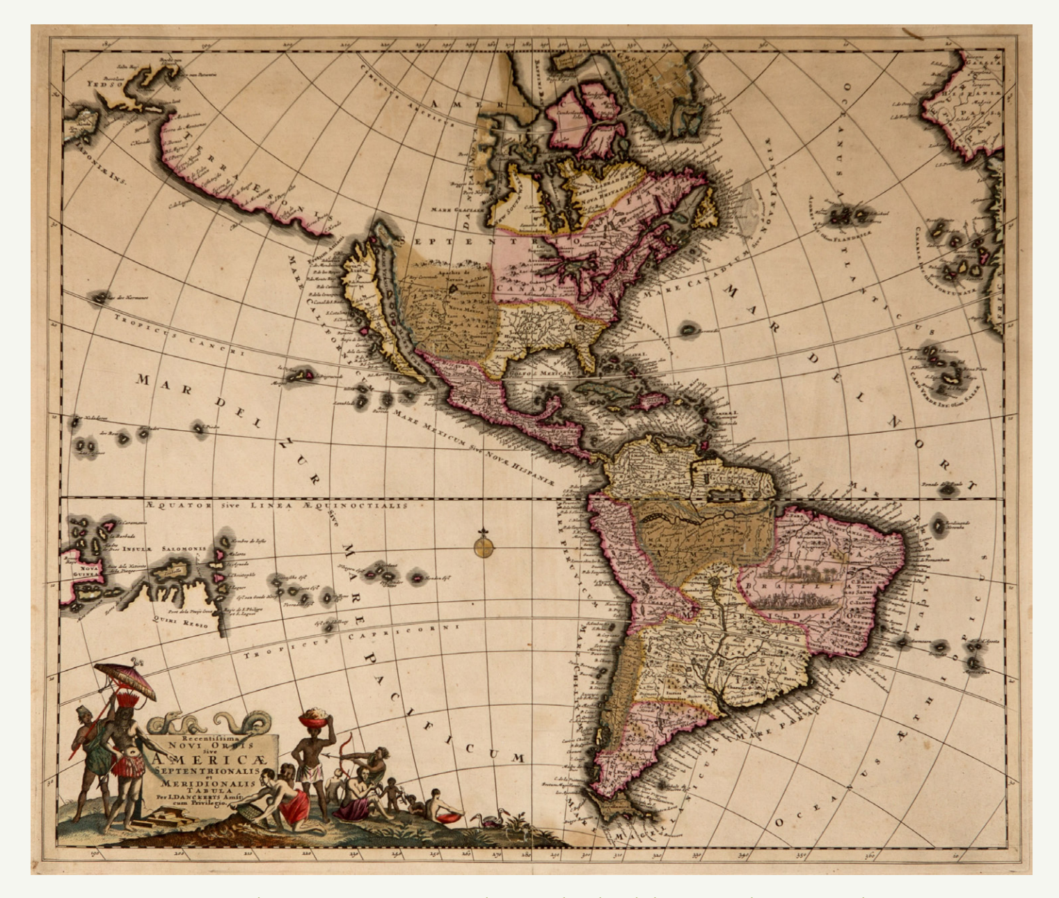
Figure 3. Recentissima Novi Orbis Sive Americae Septentrionalis et Meridionalis Tabula, cartographer Justus Danckerts, 1690.

Although the inspiration for the MIP Collection was born out of a longtime love for maps found in books, the collection also includes maps from outside the realm of literature. One of the most famous geographic misconceptions in the history of cartography is the representation of California as an island. This falsehood arose in the 16<sup>th</sup> century and continued to be reproduced on maps through the 18<sup>th</sup> century, even after explorers had proved that it was not its own land mass. We include Justus Danckerts' 1697 Recentissima novi orbis, sive, America septentrionalis et meridionalis tabula in the MIP because the map shows California as an island along with several other cartographic errors, including Terrae Esonis — a land bridge connecting North America and Asia; Danckerts' map is