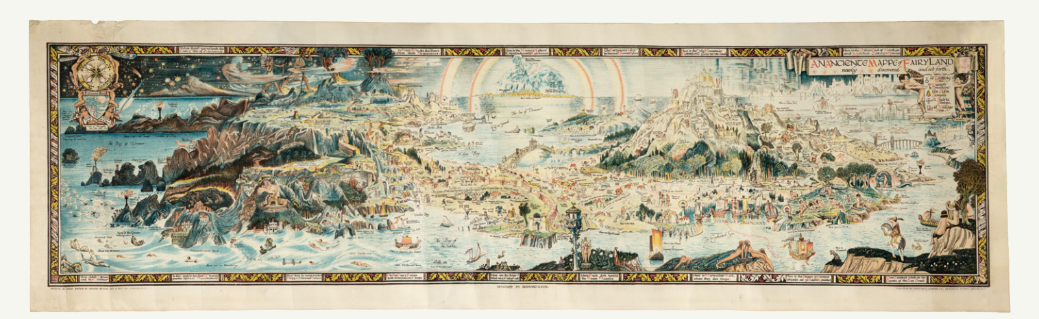
Figure 2. An anciente mappe of Fairyland: newly discovered and set forth, cartographer Bernard Sleigh, 1925.

A highlight of the collection is the 1925 Bernard Sleigh An ancient mappe of Fairyland: newly discovered and set forth (Figure 2). Sleigh's map displays a collective geography in which characters from mythology, fairy tales, and legend share a common land.