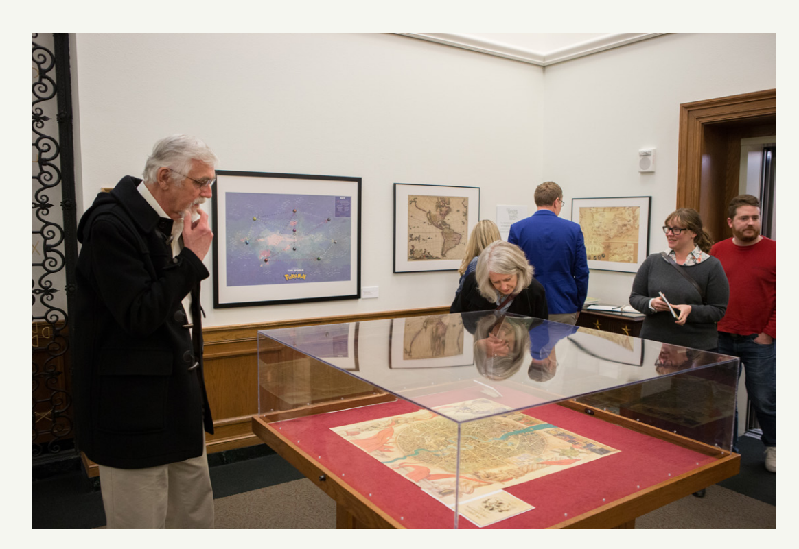
Figure 6. Exhibit attendees viewing the map of Ankh-Morpork.

To date, the exhibit is enjoying substantial praise and success (Figure 6). We are gratified that so many people are finding or rediscovering the same love of fictional maps that we have, and it is our hope that this exhibit will shine a new and lasting light on the MIP Collection as a whole.