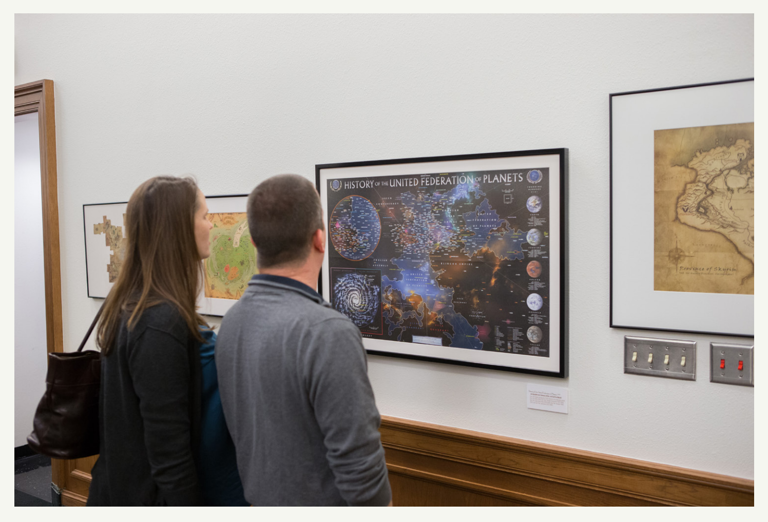
Figure 4. Exhibit attendees viewing the United Federation of Planets map.

of detail as given in their shows of origin and built creatively upon it, describing planets and entire star systems from vague or one-off references and vastly expanding on a universe's given geographical complexity. The Federation map, in a reverse phenomenon, telescopes a sprawling universe — built over the course of six separate television shows and a movie series — that the cartographers have reduced to a manageable size by stressing locations and events of particular significance to the overall Star Trek narrative (Figure 4).